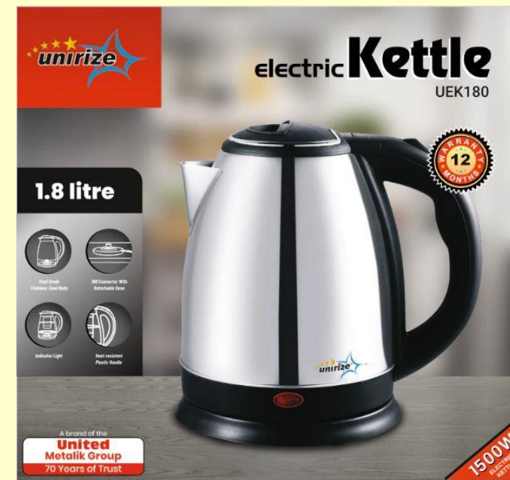
Mr Cook Unirize 1.8 Ltr Electric Kettle

Note : gift images mentioned above are for representation purpose only actual gift may vary in brand, design, size and color